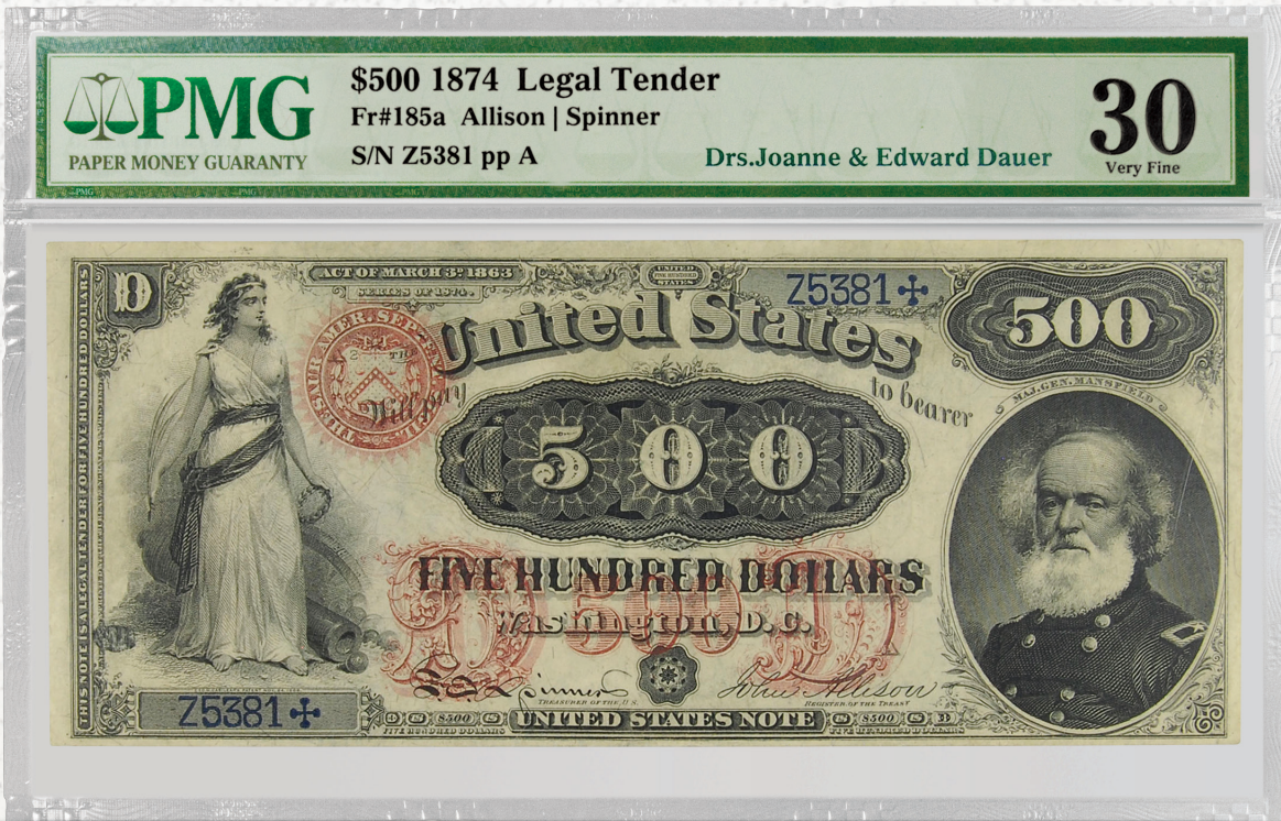
USA Fr. 185a 1874 $500 Legal Tender PMG Very Fine 30

This 1874 $500 Legal Tender Note is an outstanding example of an issue with only five known surviving examples, one of which is located in the Smithsonian Institution. The Dauer specimen is the finest of the examples known. This note also comes with a historic pedigree, hailing from Amon Carter's collection.