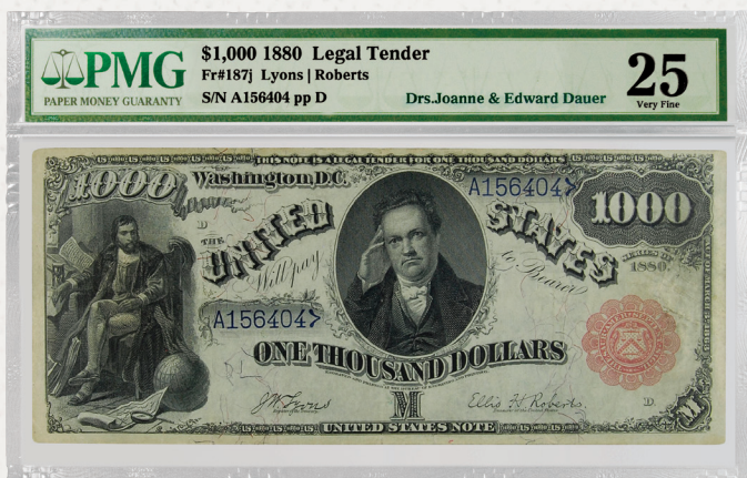
USA Fr. 187j 1880 $1,000 Legal Tender PMG Very Fine 25