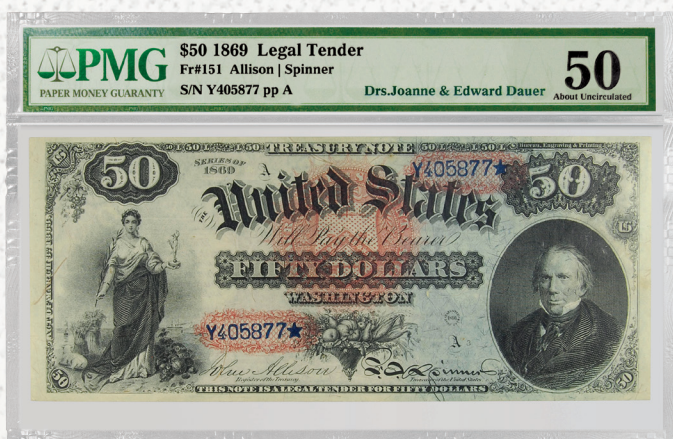
USA Fr. 151 1869 $50 Legal Tender PMG About Uncirculated 50