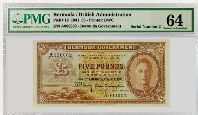
Bermuda Pick# 12 1941 £5 PMG Choice Uncirculated 64