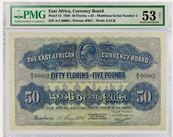
East Africa Pick# 12 1920 50 Florins PMG About Uncirculated 53 Net