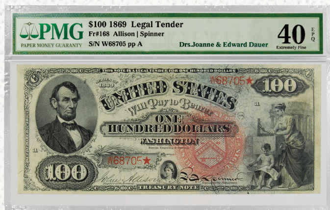
USA Fr. 168 1869 $100 Legal Tender PMG Extremely Fine 40 EPQ