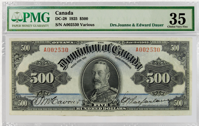
Canada DC-28 1925 $500 PMG Choice Very Fine 35

This 1874 $500 Legal Tender Note is an outstanding example of an issue with only five known surviving examples, one of which is located in the Smithsonian Institution. The Dauer specimen is the finest of the examples known. This note also comes with a historic pedigree, hailing from Amon Carter's collection.